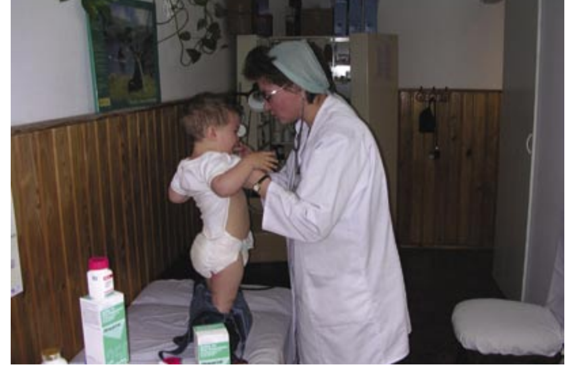
Romanian pediatrician and child