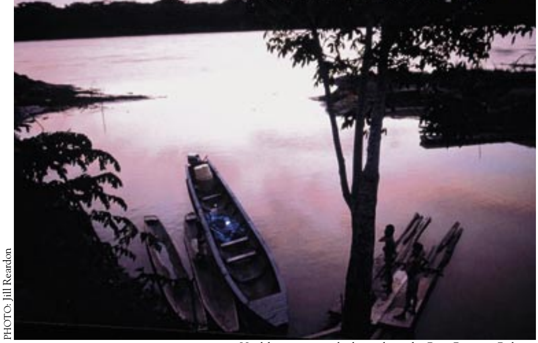
Health care arrives by boat along the Beni River in Bolivia.